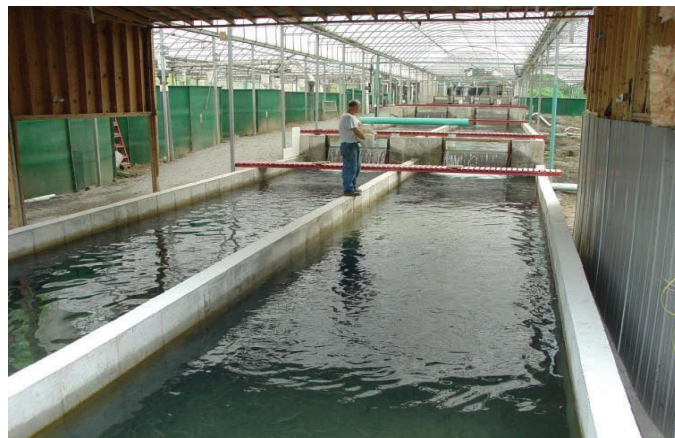
Flowing water system for commercial production of trout

National Center for Cool and Cold Water Aquaculture the mission of the NCCCWA http://www.ncccwa.ars.usda.gov is to support and enhance the nation's cool and cold water aquaculture production through research and technology transfer. The goals of the program are to improve production efficiency, aquatic animal health, and product quality through the development of economically and environmentally sustainable commercial systems and practices. Research emphases include applied genetics and breeding, integrated aquatic animal health, aquaculture engineering, nutrition, physiology, culture and management, and product quality. The focus species include, but are not limited to, rainbow trout, Arctic char, and striped bass.